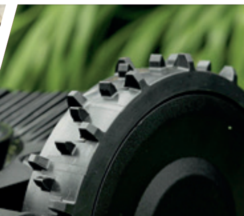
SMALL MIIMO WHEELS