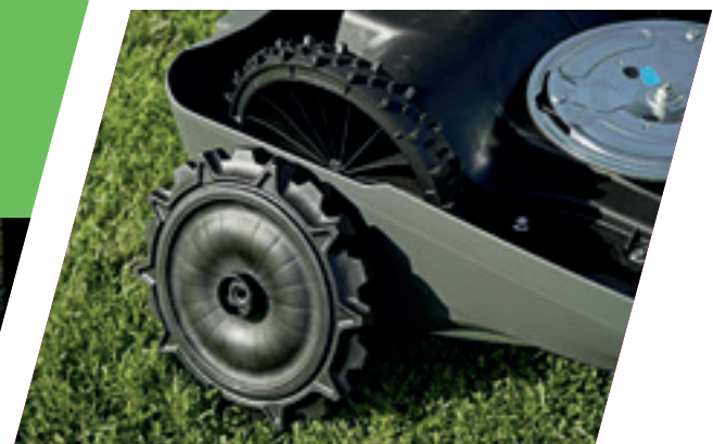
HEAVY DUTY WHEELS

Diagram is for illustration purposes only, please consult your Honda dealer for installation.