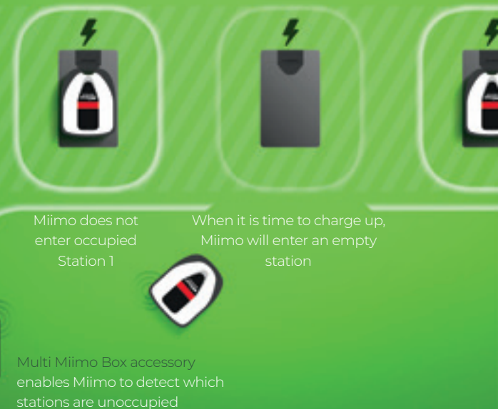
Diagram is for illustration purposes only, please consult your Honda dealer for installation.

When station is empty, it is no longer isolated from the mowing area